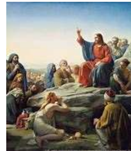
The Sermon on the Mount